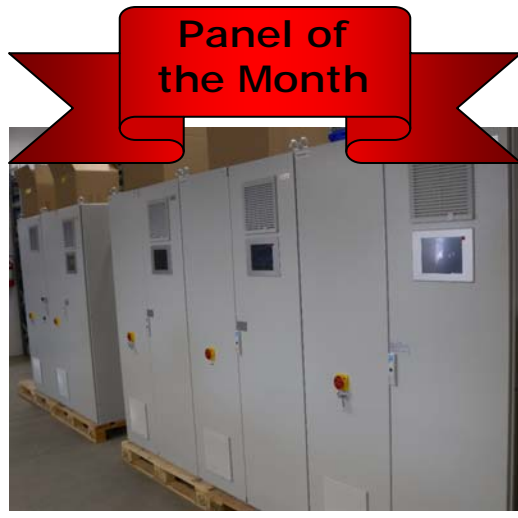
Four floor-standing panels awaiting shipment

Resources (www.kwe-tech.com) NR2 LON Handbook Tridium Commissioning Guide Automated Logic Setup Guide LON Data Points