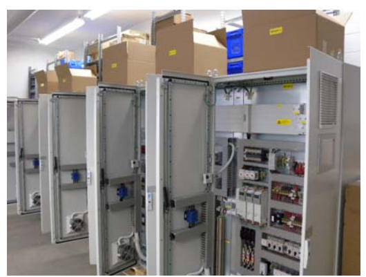
Doors open for a good look